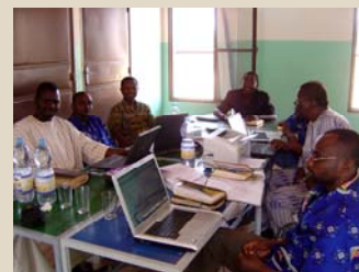
Planning session with leaders

THE REGIONS BEYOND. . . North Africa Crusade . . . Please pray for our upcoming crusade in the Islamic country of Niger. It is extremely hot in the Sahara Desert during the summer and, while April & May are the hottest months, we still expect temperatures in excess of 100°. Democratic Republic of Congo. . . Pray for the resources needed for a November crusade in a refugee camp in the war torn area of eastern DR Congo. Pygmies. . . During the time in Congo, we will travel to a remote pygmy village for ministry.. Egypt . . . Plans are developing for a conference in Egypt. It has been challenging to put together effective ministry due to a general void in leadership in areas that are unreached with the gospel. It is estimated that as many as ninety percent of churches do not have a pastor. Former Soviet Union . . . During September and October Bruce will be in Ukraine, Lithuania and Latvia for a series of leadership conferences and evangelism. Mali, Burkina Faso & Ethiopia . . . Plans are well under way for our next series of crusades and pastor's conferences across the northern sections of Africa.