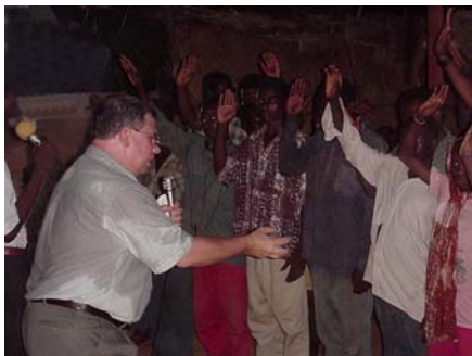
Muslims saved in North Africa

D esert covers eighty percent of Niger. The heat is so intense that rain frequently vaporizes before it hits the ground. Islam spread rapidly into Niger in the 15th century and now comprises 98% of the population. Evangelical Christianity is now only .04% with the majority being traditional animist. A startling statistic is that 95% of the Christian minority is comprised of colonial families and immigrants from neighboring coastal countries. Niger is ranked as the poorest country in the world, making it fertile territory for radical Islam which is increasing in influence.