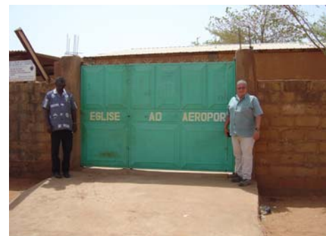
Airport Church in Niger

"Our desire is to preach the gospel in the regions beyond" 2 Corinthians 10:16