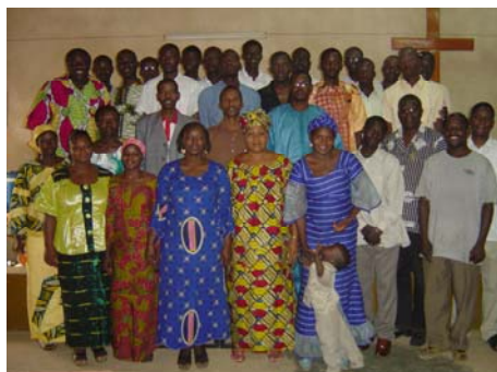
Pastor's Conference in Niger