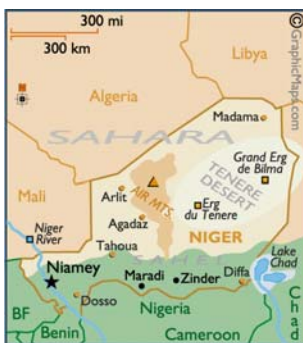
August crusade is in Niger