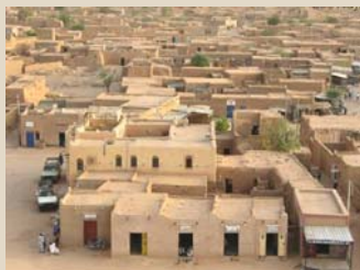
Typical town in desert