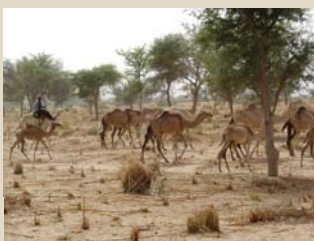
Camels at the border