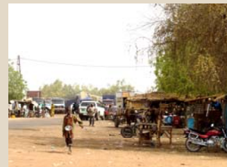
Rest stop during travel