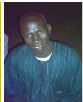
Islamic Chief Extends Invitation

Previously there was not one known Christian in the area the crusade was held. Ministering in a location like this is a challenge at best. I was somewhat surprised that many people held back from coming forward in a traditional altar call. However, they came freely once the lights were turned off. Like Nicodemus, people came for hours in the night to repent and be saved.