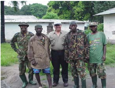
On Location At Crusade