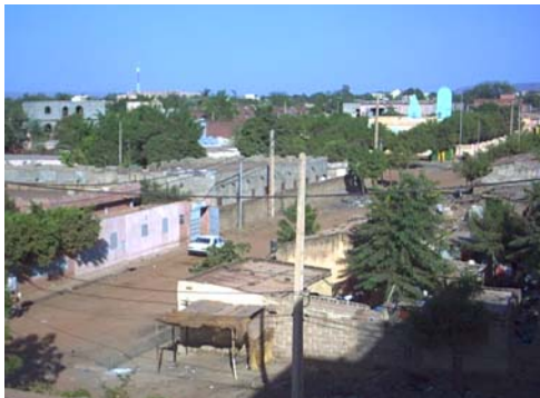
Islamic City With Mosque at Upper Right

Warning From Koran Teachers: Imams warned that no one was to rent a place to us to house a new church and for three weeks prior to the crusade, no place to hold follow-up meetings could be located. After days of intensive prayer, our coordinator visited Tariko and was approached by an Islamic man who wanted to rent his house. After two years of being away, he arrived to discover his tenants, his own relatives, had not paid rent the entire time. He immediately threw them all out and let us move in, saying he now had more trust for Christians than his own people. For him to defy the orders of the Imams and go against his own clan is miraculous considering the city he lives in is known for radical Islam.