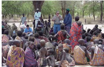
Pioneer Evangelism Eight Mile Hike Each Way In Blazing Sun To Unreached Village