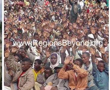
Salvation in Ethiopia