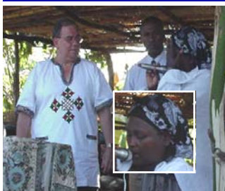
Deaf Woman Healed

S alvation To The Ends Of The Earth: Acts 13:47-49 In the midst of heat, dust and eight to ten hour services, the excitement of large crowds soon passes. Nights that are too short, food that leaves much to be desired and the weariness of an incredible ministry schedule are our companions. It is here that we experience the reality of God's call on our lives and His desire that none should perish. Many years ago while traveling in Mongolia, the words of the circuit riders was carved into my heart " It is worth it all to see the salvation of souls ". In the deep parts of Africa, in areas where few (if any) go; where life spans are short; where false religions (and worse) are more common than Christianity; and where they will never hear unless the gospel is brought to them, people are being saved!