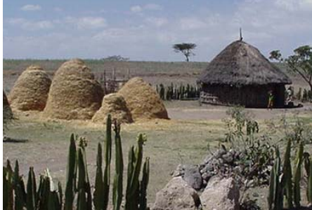
Traditional House with Teff harvest