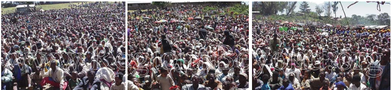
A portion of the estimated crowd of over 40,000 at the Feshengete Crusade

S alvation To The Ends Of The Earth: Acts 13:47-49 In the midst of heat, dust and eight to ten hour services, the excitement of large crowds soon passes. Nights that are too short, food that leaves much to be desired and the weariness of an incredible ministry schedule are our companions. It is here that we experience the reality of God's call on our lives and His desire that none should perish. Many years ago while traveling in Mongolia, the words of the circuit riders was carved into my heart " It is worth it all to see the salvation of souls ". In the deep parts of Africa, in areas where few (if any) go; where life spans are short; where false religions (and worse) are more common than Christianity; and where they will never hear unless the gospel is brought to them, people are being saved!