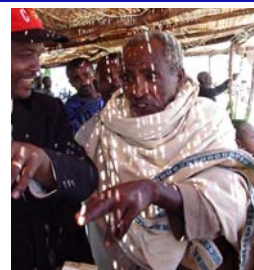
Blind Man Healed